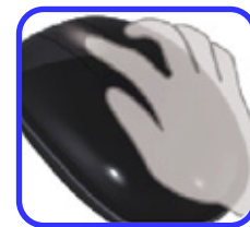
Touch Scroll Pad