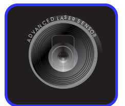
Enhanced Optical Engine